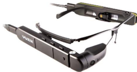
BlueJeans by Verizon now supports Vuzix M4000 and M400 Smart Glasses

BlueJeans by Verizon empowers fast and easy face-to-face communications, using video conferencing solutions to help bring people closer together for more effective collaboration. The platform combines high-quality audio, HD video and web-conferencing capabilities for cloud-based meetings or large interactive events and is now available to run hands-free on the Vuzix M400 and M4000 Smart Glasses.